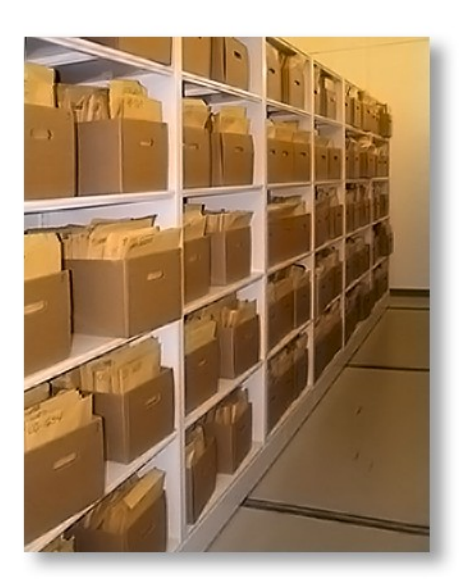
EXAMPLE 9B: Modular/Uniform Shelving