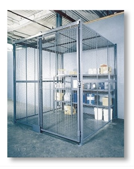
EXAMPLE 3B: Bulk Storage Locker/Cage