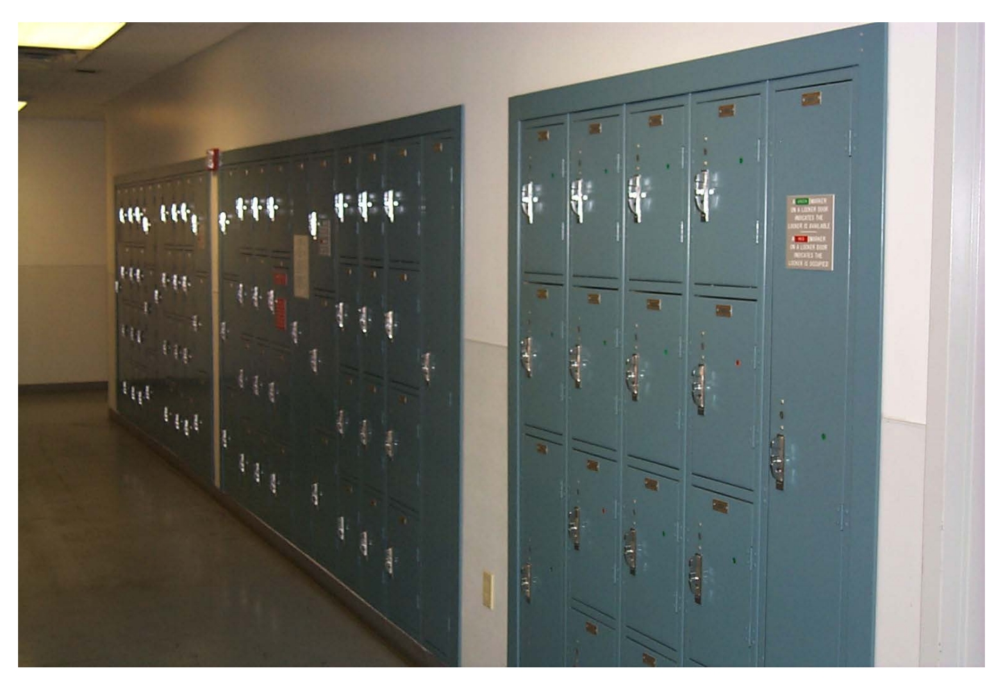
MAIN STATION SUBMISSION LOCKERS

Property and evidence may be submitted by placing the items into a submission locker located in the basement of the Evidence/Identification building or by directly transferring the items to an Evidence Technician.