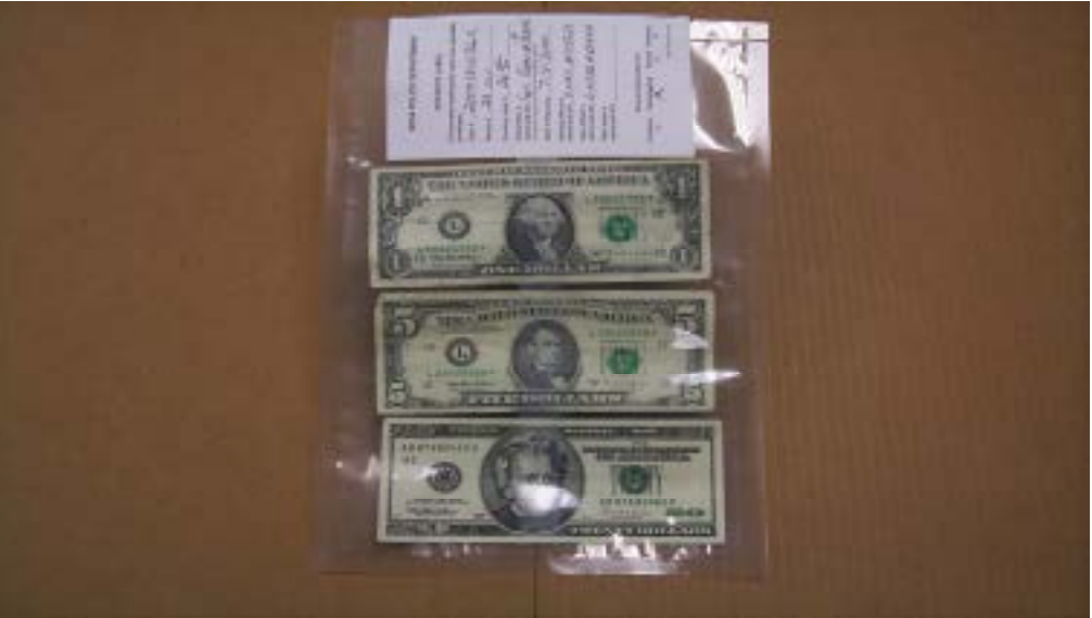
PACKAGING CURRENCY SEPARATE FROM OTHER ITEMS: