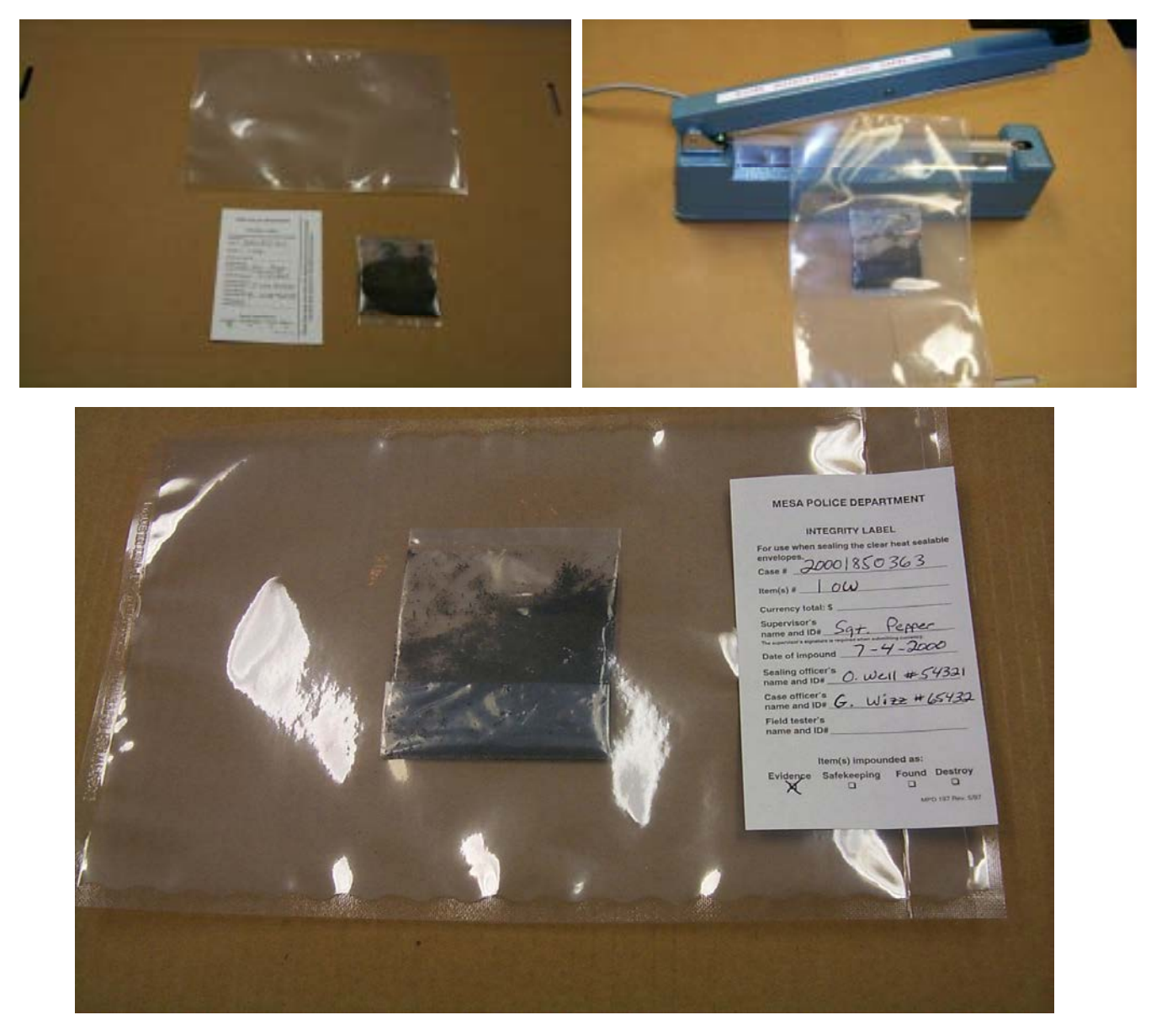
PACKAGING OF CONTROLLED SUBSTANCES