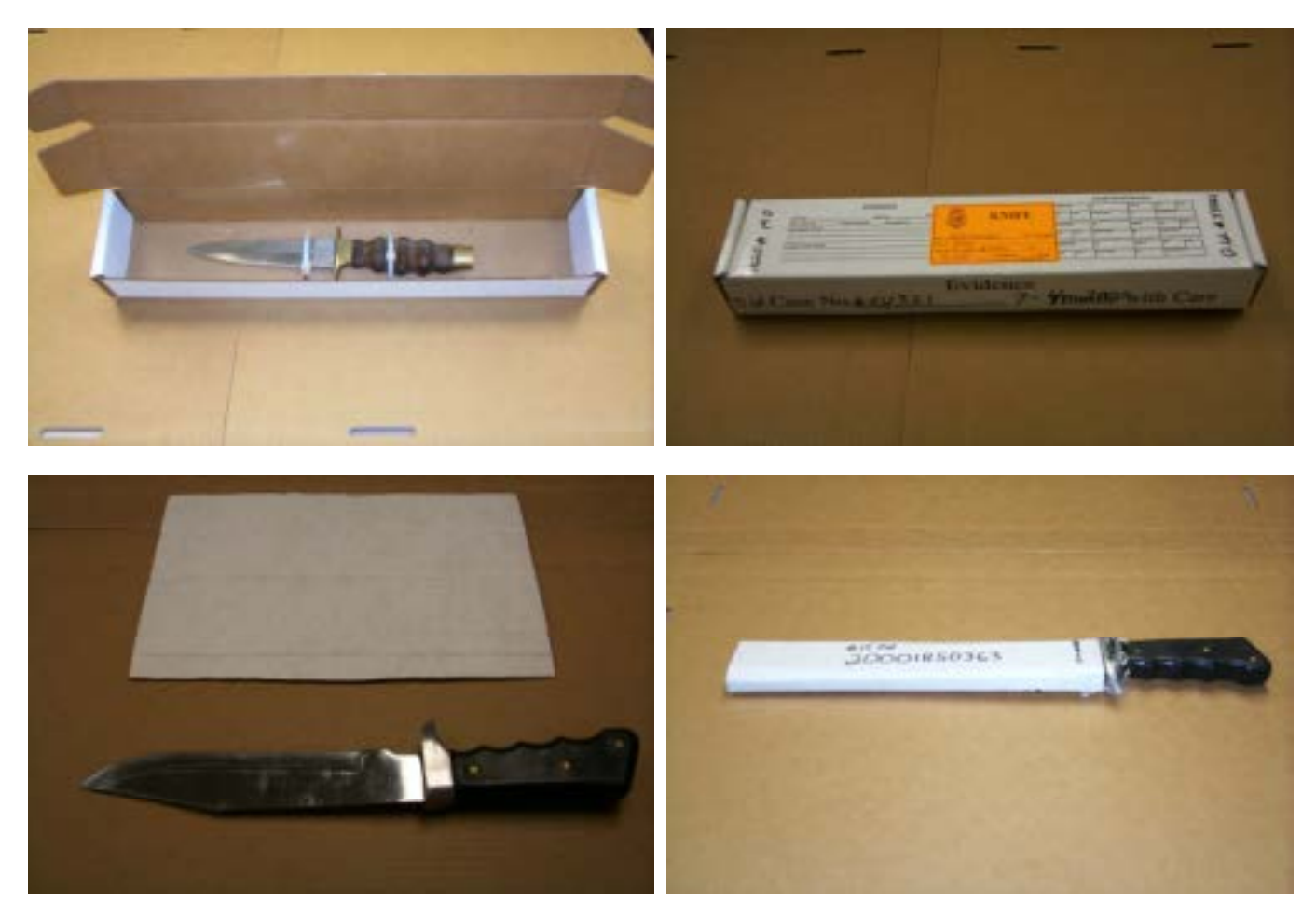
PACKAGING OF KNIVES AND OTHER LARGE SHARP ITEMS: