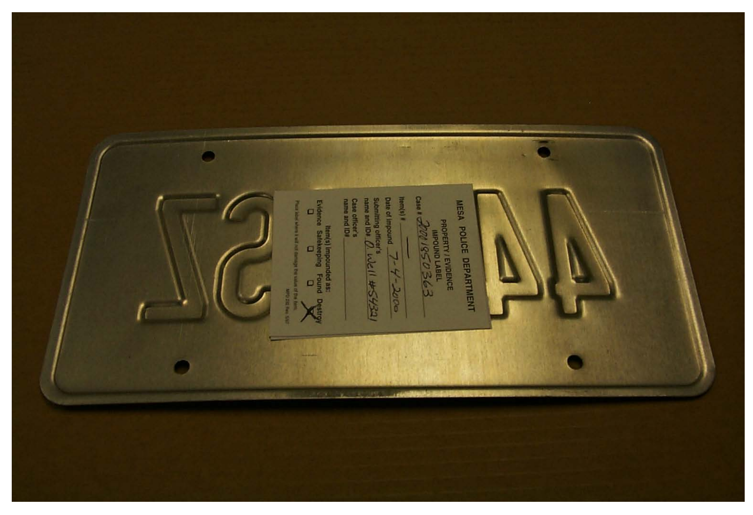
SUBMISSION OF LICENSE PLATES FOR DISPOSAL: